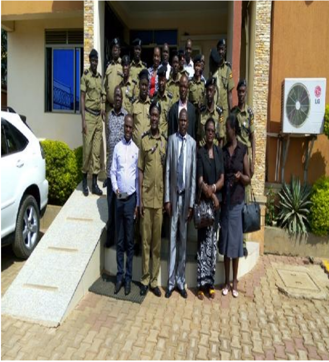
Above; PLA programme officer on the left of the front line with the rest of the members of the team that developed the Uganda police training manual.

information on human trafficking and positioned to undertake effective investigations. PLA was the only civil society organisation called upon as the lead facilitator of the development process of the training manual given her expertise in the field