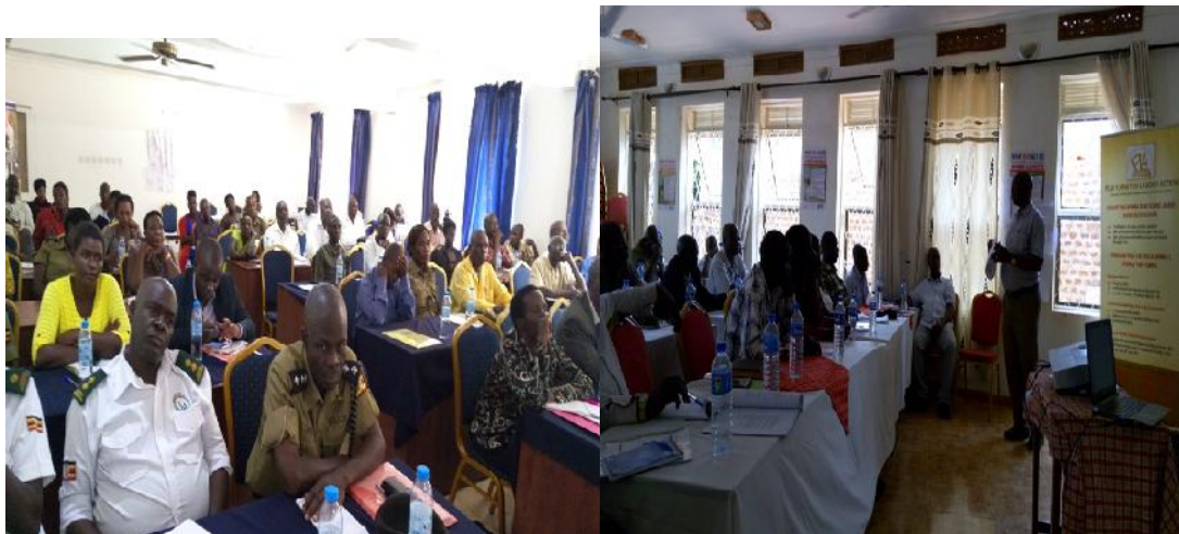
Above: On the left are law enforcement officers at the training in Busia and on the right is the National Coordinator of Anti- Human Trafficking Task Force Ministry of Internal Affairs facilitating the training in Tororo district.

As a result of the training, a fully fledged human trafficking desk was set up at the Busia Central Police to respond and handle cases and incidences of trafficking in persons. A joint anti-trafficking patrolling task force between Uganda and Kenya at the Busia Boarder was also established. This anti-trafficking task force has since carried out operations resulting in interceptions of possible victims of trafficking. In addition the trained law enforcement agents created awareness in communities and the community members are more vigilant on issues of trafficking in person. According to the reports from the districts, the traffickers have had to change the routes from Busia and Tororo to Rwaka in Mbale.