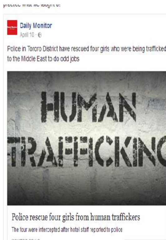
Above: New Vision (Right) and Daily Monitor, Uganda's leading News papers of 10 th April 2016 disseminating information on the victims of trafficking rescued in Tororo district.