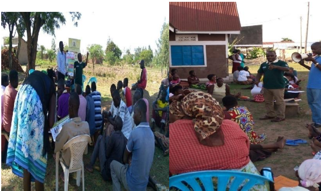
Above: Left is PLA Programme Officer conducting awareness in Tororo district Mela Sub County while on the Right , the PLA Legal Assistant conducting awareness in Busia district

During the commemoration of the World Day against Trafficking in Persons, a total of 77(52 female and 25) including policy makers, prosecutors, investigators, victims/ survivors of trafficking in person, civil society organizations working to address issues of trafficking in person, local council leaders, members of the National Task force and media personnel were convened to raise awareness of the realities of trafficking in person and situation of victims of trafficking in person and to raise awareness on the safe options of going to work abroad.