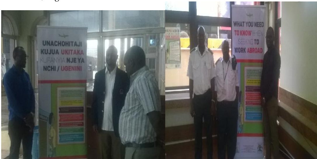
Above: The immigration officers from Busia and Malaba Border points posing for a photo after receiving a banner on 'what you need to know before going abroad from PLA staff'

200 t-shirts with awareness messages on trafficking were printed and distributed to 183 the different trained law enforcement officers, duty bearers, community volunteers and PLA filed staff. Furthermore, 6 pull-up banners in English, Luganda and Swahili, were developed and printed with awareness messages on safe options of going to work abroad, schemes used by traffickers, where to report trafficking in persons and also cautioning and warning the public on the realities of human trafficking. The banners were placed at both Kenyan and Ugandan boarder points of Busia and Malaba to serve as an informative medium in raising awareness to those departing and arriving in Uganda, mainly on the existence of human trafficking and the need for safe movement/migration.